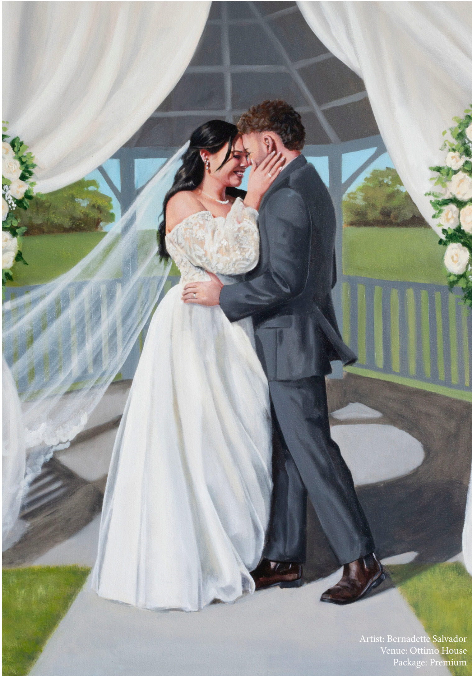
Artist: Bernadette Salvador Venue: Ottimo House Package: Premium