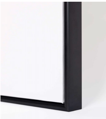
Black Matt Frame