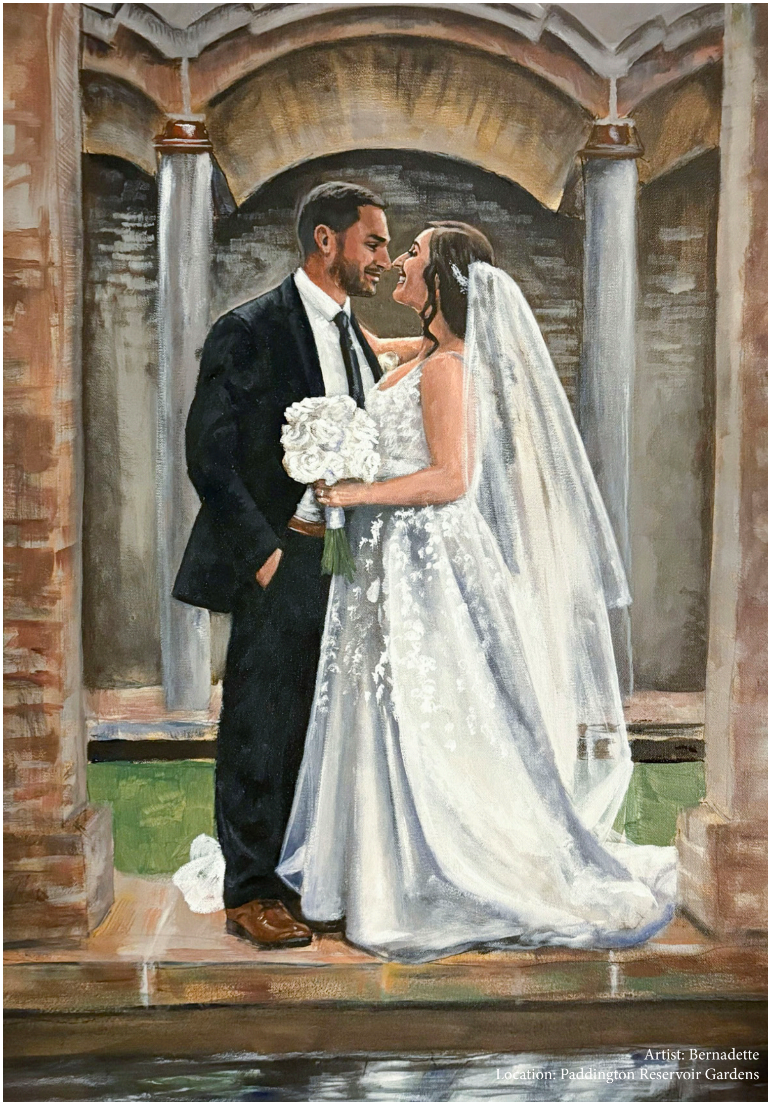
Artist: Bernadette Location: Paddington Reservoir Gardens