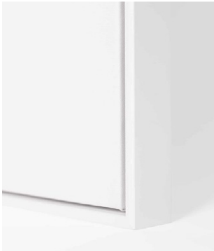
White Timber Frame