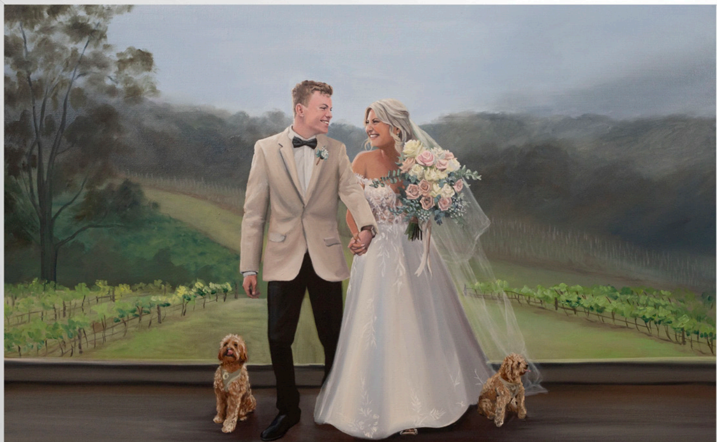
Interactive Element - Completed painting with guests marks within the layers of the finished work.