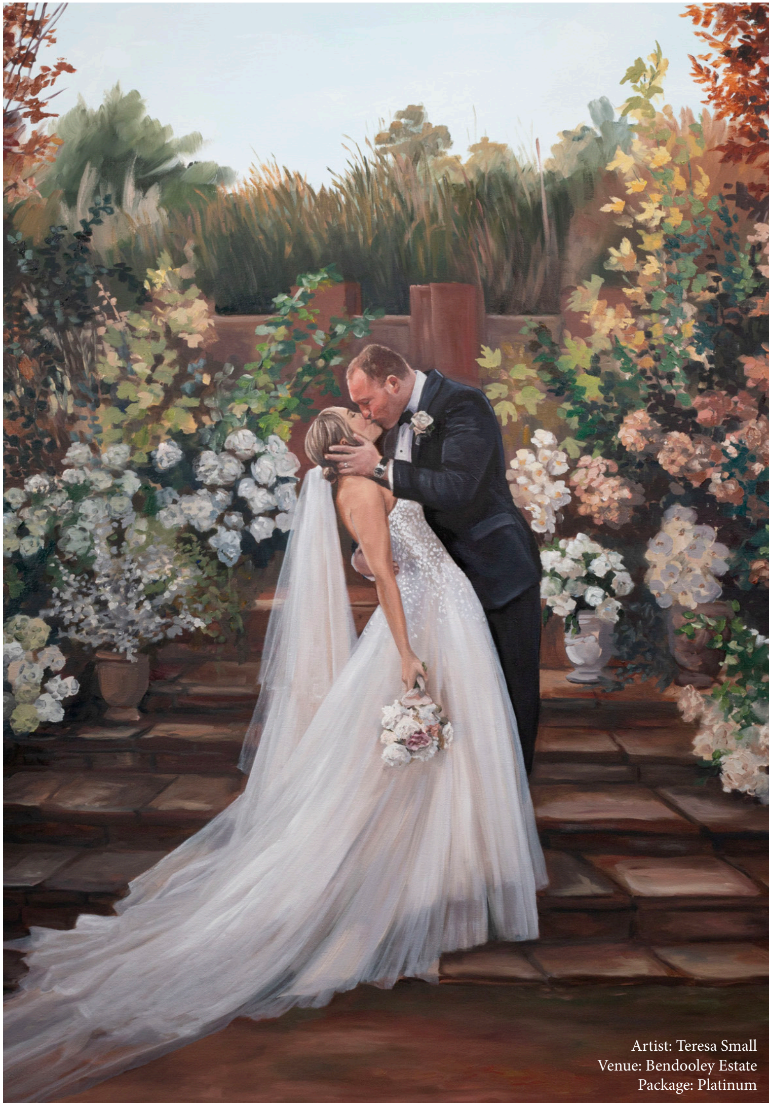
Artist: Teresa Small Venue: Bendooley Estate Package: Platinum