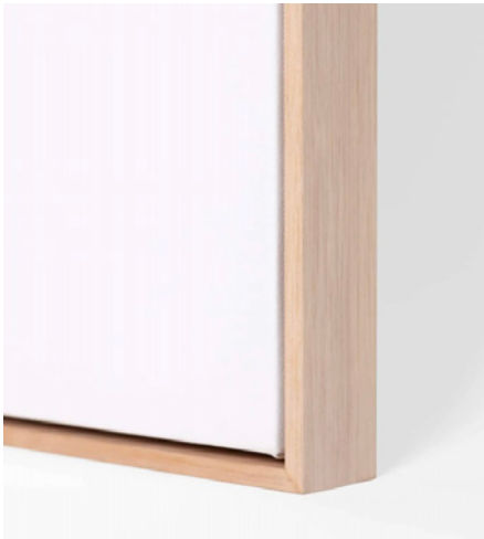
Tasmainian Oak Frame

We then work with our framing partner to custom build and assemble the frame. This process can take up to two weeks. Once the framing is completed we will be in touch to organise the delivery or local pick up of your artwork.